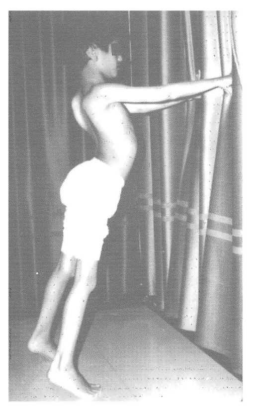
Fig. 2. Saudi boy (patient 13) at 10 years showing tendency to spontaneous equinus positire of feet and masked hyperlordosis. Muscle biopsy was dystrophin positive but showed selective deficiency of adhalin.

The clinical features of SCARMD as seen in Saudi Arabia are remarkably similar to those described previously in communities with high consanguinity rates in Sudan (Salih 1980, 1982; Salih et al. 1983), Tunisia (Ben Hamida and Fardeau